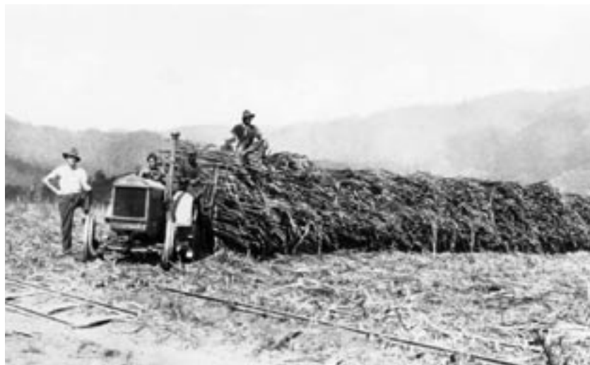
Farmers transporting harvested cane by rail trucks to the refinery mills. Queensland, c.1925.

tons of cane, average production £4,000, profit calculated £1,600. Annual pay £191.11.6 that is, about 12% of pure profit. In Australia it is the sugar plantations which yield more in taxes to the state than any other category, except stock-raising.