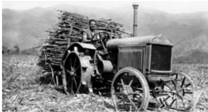
Transporting harvested cane to the refinery mills. Queensland, c.1925.