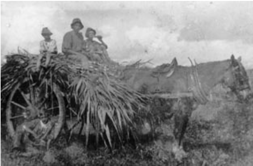
TOP: Transporting sugar cane. Queensland, c.1920.